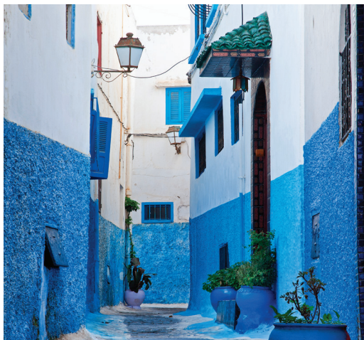
Rabat's Kasbah des Oudaias

Day 13: Marrakech/Casablanca We leave Marrakech this morning by coach for storied Casablanca, Morocco's largest and most cosmopolitan city. After a brief orientation tour of the city, we visit the magnificent Hassan II Mosque, Morocco's only functioning mosque open to non-Muslims. Tonight we celebrate our Moroccan adventure at a farewell dinner at a local restaurant. B,D