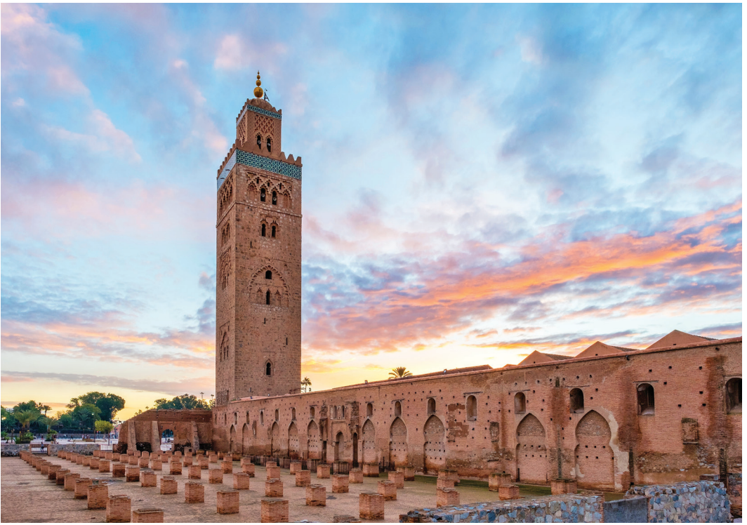
We see the distinctive Koutoubia Mosque – Marrakech’s largest – on Day 11.

Day 6: Fez We begin today with a walk through the medina and a visit to the Al-Attarine Madrasa, whose highlight is a small courtyard showcasing intricately detailed tilework and carving decorations. Then we embark on a walking tour of the medina focusing on the artisans’ quarters, the 14 th -century Koranic schools, and Al Karaouine, the medieval theological university. After lunch on our own, we visit the Borj Nord Arms Museum, an authentic Saadi fort that dates from 1582 and one of Morocco’s only European-influenced forts. After exploring the Moroccan armaments here, we are free this afternoon for independent exploration or relaxation. Tonight, we enjoy a private dinner at an intimate family-run riad in Fez. B,L,D