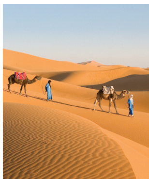
We ride camels in the Sahara.

Day 11: Marrakech Once the capital of southern Morocco, the imperial city of Marrakech is an alluring oasis with a temperate climate, distinct charm, and fascinating sights. Our day-long tour includes the beautifully proportioned Koutoubia Mosque, the lovely Andalusian-style El Bahia Palace, and the ruins of 16 th -century Palais El Badii. After lunch at our hotel, mid-afternoon we visit Dar El Bacha, a formerly