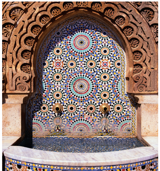
Traditional Moroccan tile work

Day 10: Ouarzazate/Ait ben-Haddou/Marrakech En route to Marrakech today, we stop first at uninhabited Ait ben-Haddou, a UNESCO World Heritage site and one of southern Morocco’s most scenic villages that is often used as a location for fashion and film shoots. Its old section consists of deep red kasbahs