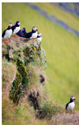
We may see puffins while on our tour.

rift valley. Revered for its historical importance – this is where Iceland’s Althing, or national assembly, met in open-air sessions from 930 CE to 1798 – Thingvellir also sits on an active volcanic site at the spot where the fissure between the geological plates of North America and Europe is most evident in Iceland. It’s also a gem of nature, with canyons, caves, waterfalls, and ponds surrounded by snowcapped mountains. We learn about the historic parliament founded here in 930 CE, and walk along a gorge into the rift valley itself. Following our visit here, we head to a local farm for lunch, then depart for famed Great Geysir and Gullfoss, Iceland’s immensely popular “golden” waterfall. We continue on to Reykjavik, home to more than half of the nation’s population and ranking as one