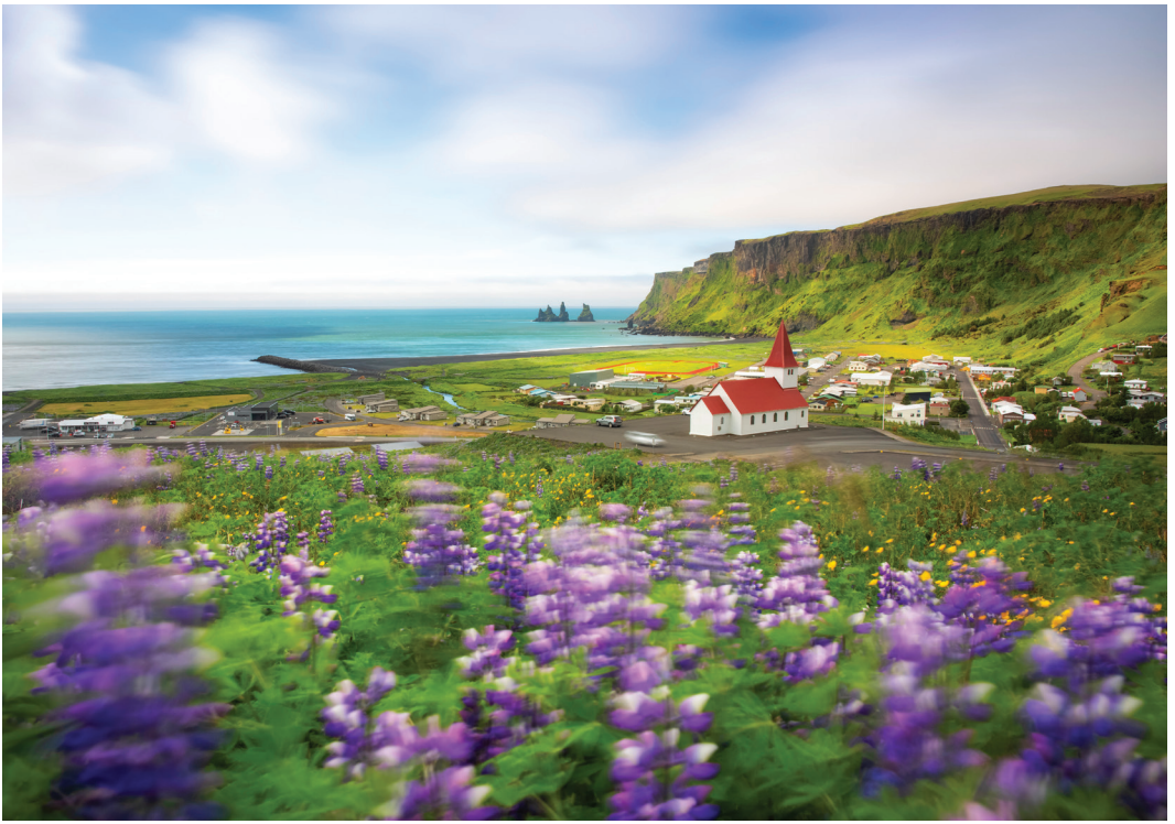
We spend days exploring the scenic Icelandic countryside.

Next, we visit Hljodaklettur Echo Cliffs, where we explore the labyrinth of “echoing rocks” created by the spiral basalt formations of the arches and canyons here. Our last stop: jaw-dropping Dettifoss, Europe’s most powerful waterfall and Iceland’s “Niagara.” B,L,D