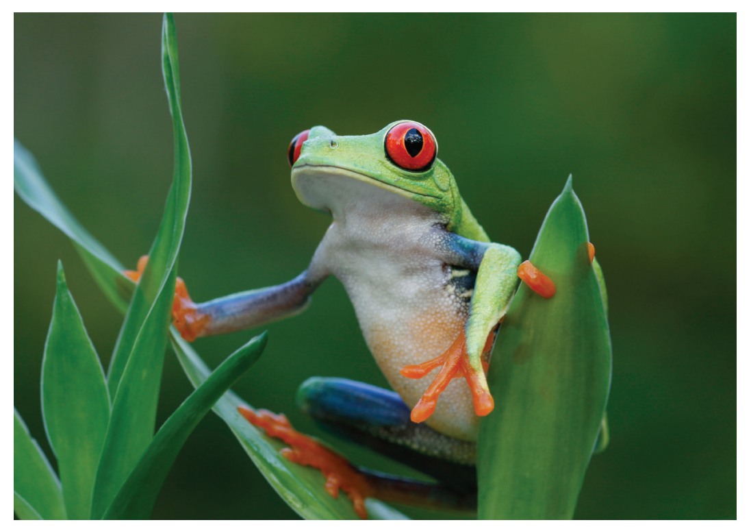
We see many colorful tree frogs in Costa Rica's rainforests.

Day 5: Arenal Region On this morning's visit to Arenal's Mistico Park hanging bridges, we have the special opportunity to experience the rainforest from the canopy level as we traverse a series of five suspension bridges high above the forest floor. While we observe the rainforest from a unique perspective, our naturalist guide will point out some of the flora and fauna that thrive here. Then we return to our hotel, where the remainder of the day is at leisure to relax amidst the beautiful grounds and thermal waters. Lunch and dinner today are on our own. B