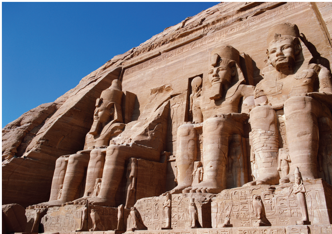
The magnificent temples at Abu Simbel commemorate Ramses II and his queen, Nefertari.

Day 7: Lake Nasser Cruising – Amada/Kasr Ibrim/ Abu Simbel We sail this morning to Kasr Ibrim, the last remaining Nubian settlement in its original location. We learn about this ancient site while overlooking it from the ship's sun deck. Then we continue on to Abu Simbel's massive complex of temples guarded by statues of Ramses II and his wife Nefertari, with well-preserved murals inside. B,L,D