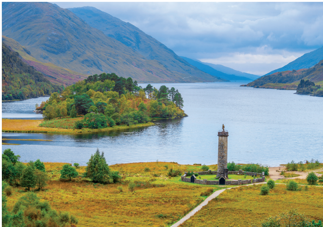
We'll visit the Glenfinnan Monument honoring "Bonnie Prince Charlie" on Day 5.

Day 5: Fort William/Isle of Skye We embark on a full-day excursion to the Isle of Skye, the largest of Scotland's Inner Hebrides, known for its vivid history, strong Gaelic influence, and stunning scenery. En route, we make a photo stop at Glenfinnan Monument, honoring "Bonnie Prince Charlie" for his leadership in the Jacobite Rising of 1745. Then we board a ferry for Armadale on the southern tip of the Isle of Skye. Our touring begins with a visit to Armadale Castle and Gardens, where we have lunch. Next we set out on a scenic drive through the imposing Cuillin Hills (or "Black Cuillin"). Returning to the mainland via the Skye Bridge, we stop to visit iconic Eilean Donan Castle then dine tonight at our hotel. B,L,D