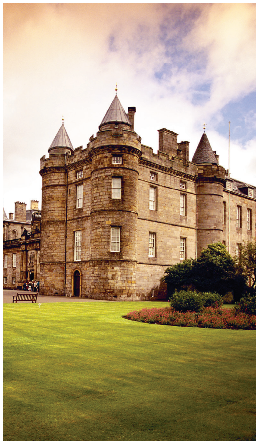
Scotland is home to more than 1,000 castles.

Day 12: Depart for U.S. We transfer this morning to the Edinburgh airport for our return flights to the U.S. B