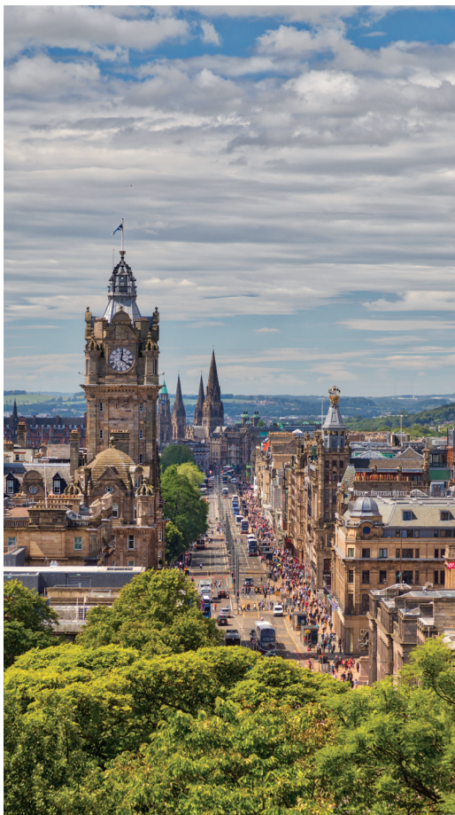
Edinburgh's grand and historic Princes Street