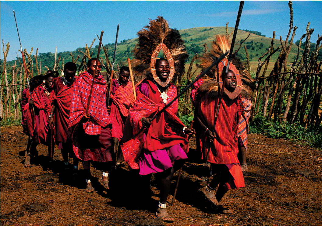
We visit a Maasai village to learn about their culture.

to see all of Africa’s “Big Five” – elephants, buffaloes, rhinos, lions, and leopards – in one place. B,L,D