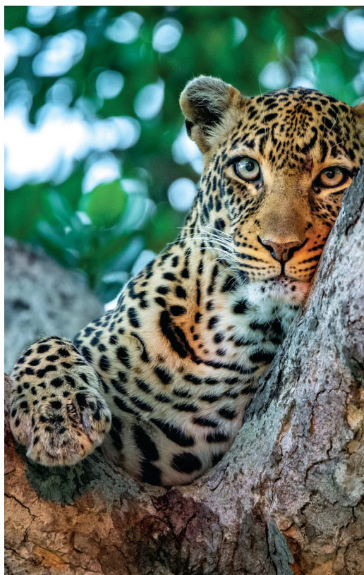
Leopard in the Serengeti

Day 15: Nairobi/Depart for U.S. After a morning at leisure, we transfer to the Nairobi airport and board our connecting flight to the U.S. B