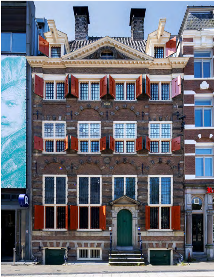
Rembrandt Huis Museum, Amsterdam

Later, embark on a guided canal cruise along Amsterdam's UNESCO-listed waterways. This evening, attend a festive welcome dinner.