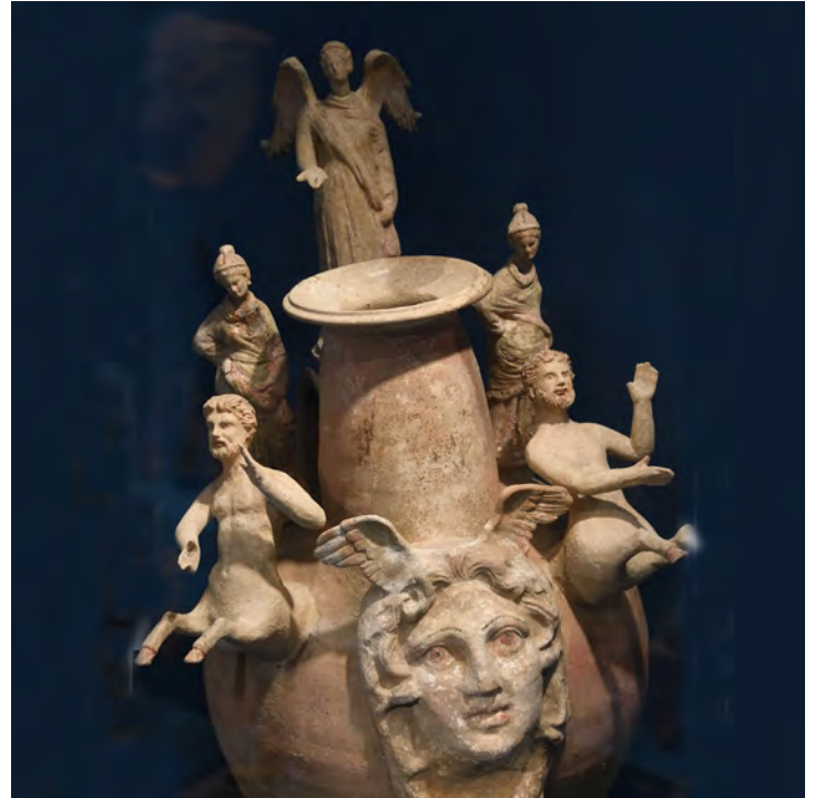
Canosa Vase, Allard Pierson, Amsterdam