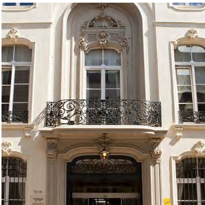
Hotel 'T Sandt Antwerp

In Brussels's historical center, this 173-room luxury property features bright, contemporary rooms accented by antique pieces.