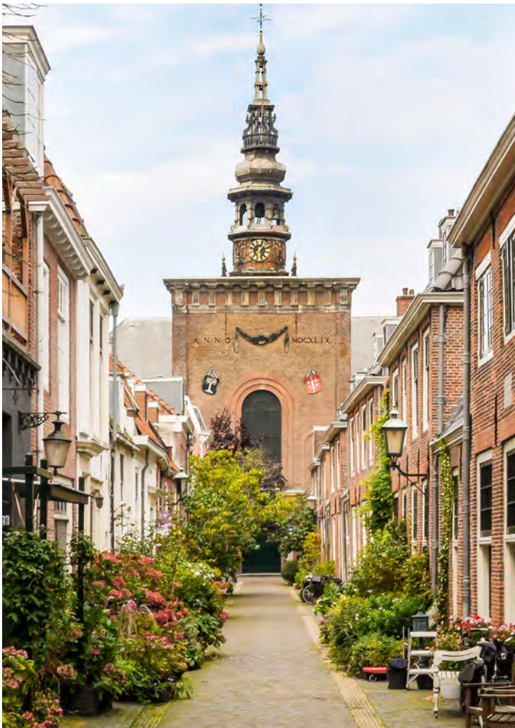
Grote Kerk, Haarlem

Then, take a guided visit to the Archeologisch Museum Haarlem , housed in a former meat hall, the atmospheric basement of the 17th-century Vleeshal. Trace the city’s transformation from prehistoric dunes to a medieval powerhouse, and encounter Cornelis, the reconstructed medieval skeleton, to gain insight into daily life in the Middle Ages.