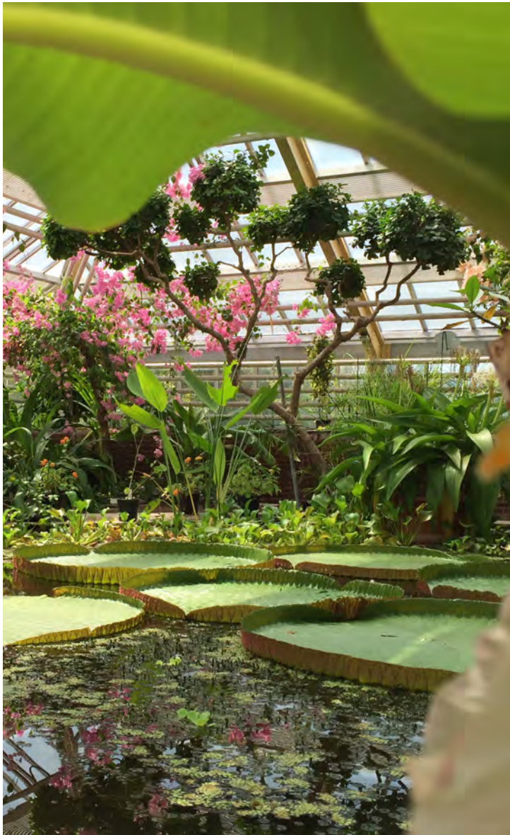
Hortus Botanicus, Leiden

As an afternoon alternative to those science-based tours, you may venture to the Museum De Lakenhal , the 1640 Leiden Cloth Hall, which houses artworks by Lucas van Leyden and Rembrandt. For dinner this evening, we may dine on a cruise along Leiden's illuminated canals ( pending confirmation ).