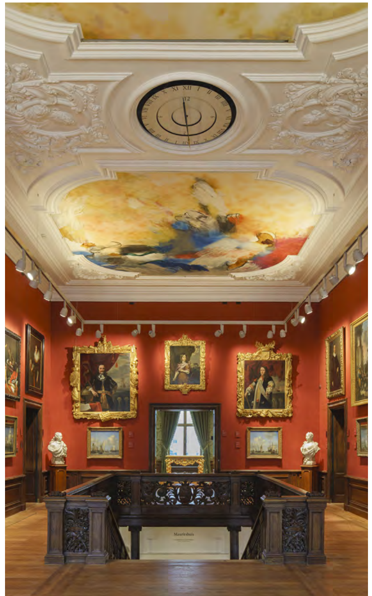
Mauritshuis, The Hague