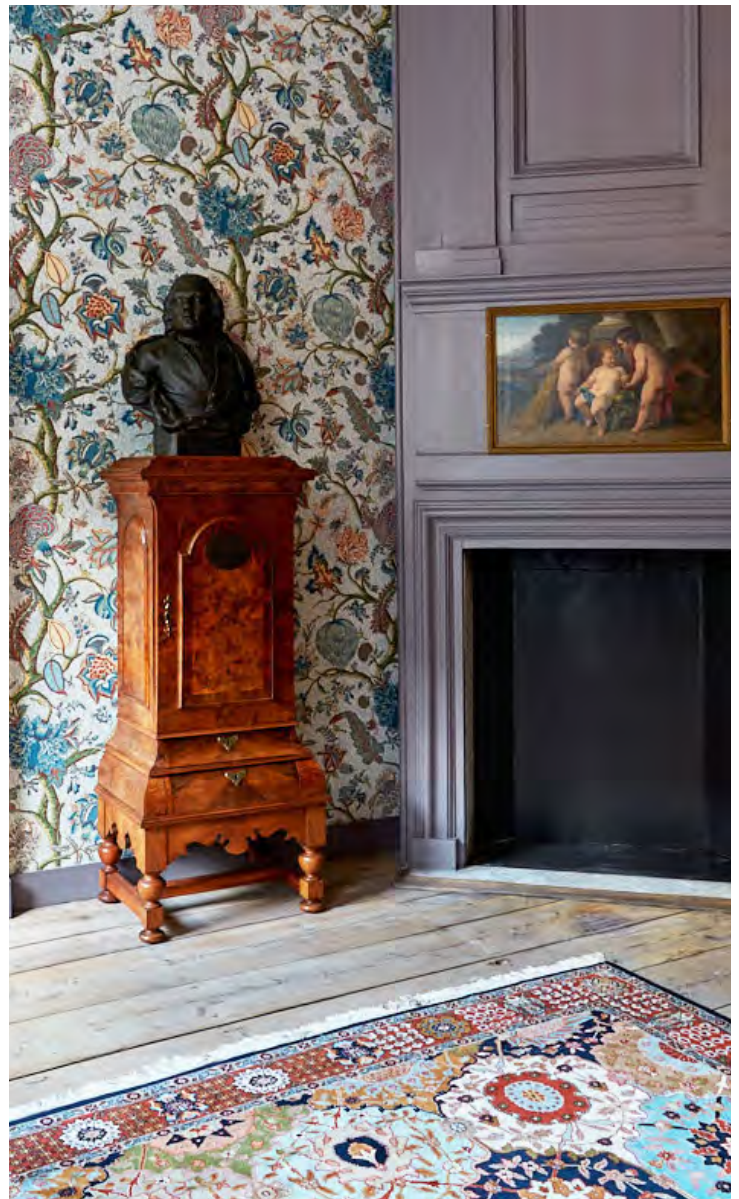
Teylers Museum, Haarlem

After lunch, enjoy free time to stroll Grote Markt , the bustling square at Haarlem’s core for centuries. Then, join a curator at the Teylers Museum , the Netherlands’ oldest museum (opened in 1784), for a guided tour of the restricted library, with its rare 18th- to 19th-century medical volumes and scientific instruments.