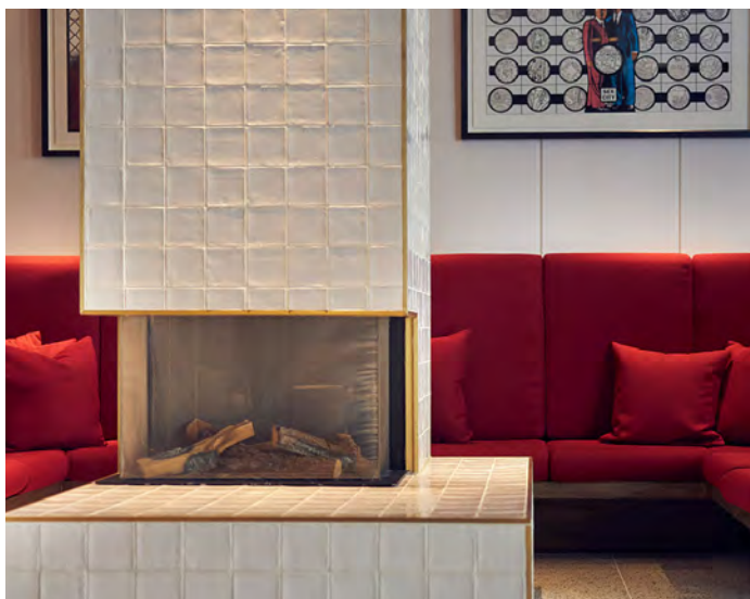
Kimpton de Witt Amsterdam