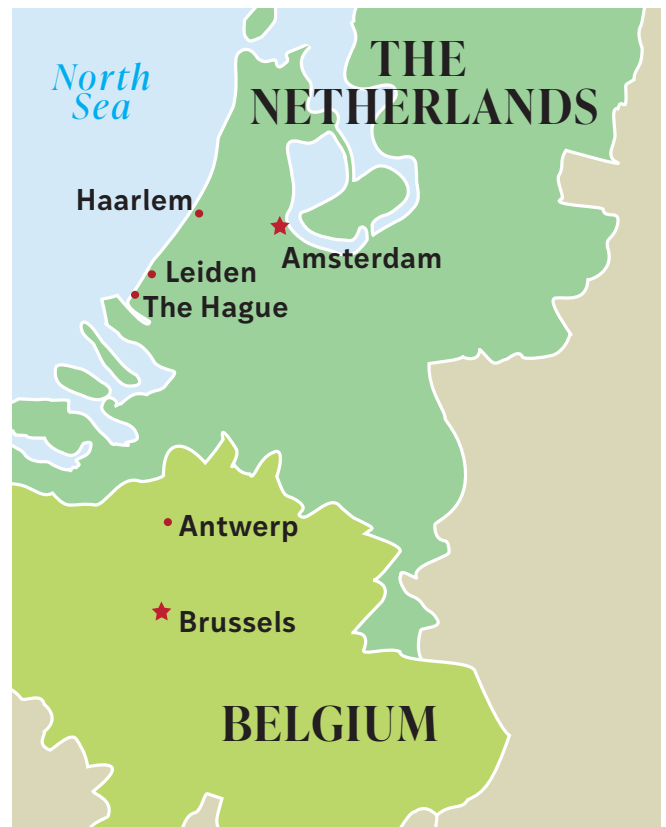
Map of the region

Visit Arrangements Abroad's website for more information about Activity and Pace Levels at www.arrangementsabroad.com/faqs .