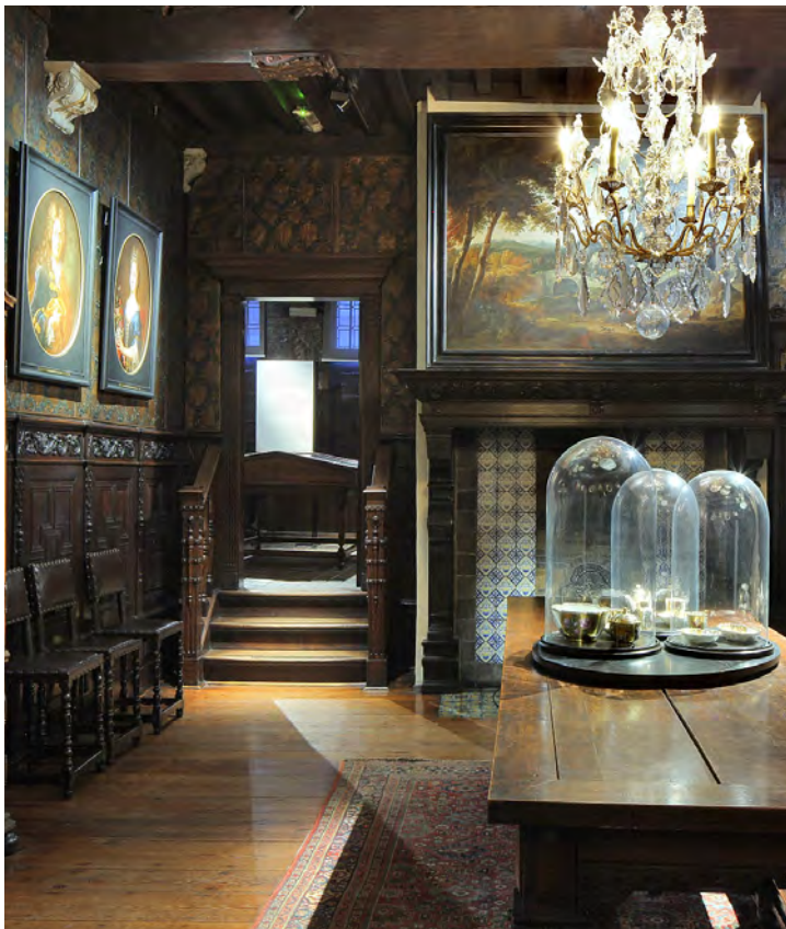
Museum Plantin-Moretus, Antwerp

Transfer to Brussels for a behind-the-scenes visit to the Bibliothèque Royale de Belgique (KBR) , Belgium's national library, for a private look at its rare books collection, including first and second editions of Vesalius's 1543 De Humani Corporis Fabrica —the book whose first edition also resides in WashU's own Becker Medical Library.