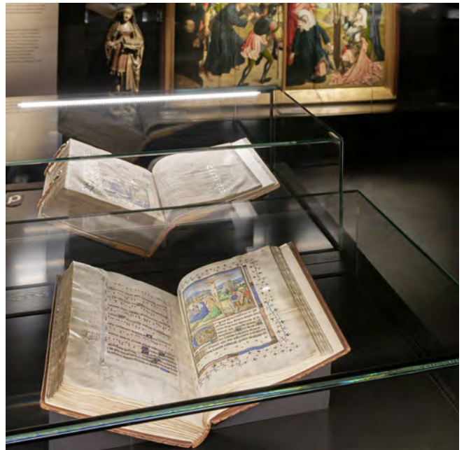
Bibliothèque Royale de Belgique (KBR), Brussels